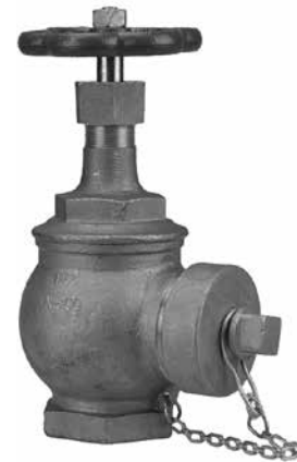
T-331-HC Threaded w/Cap and Chain